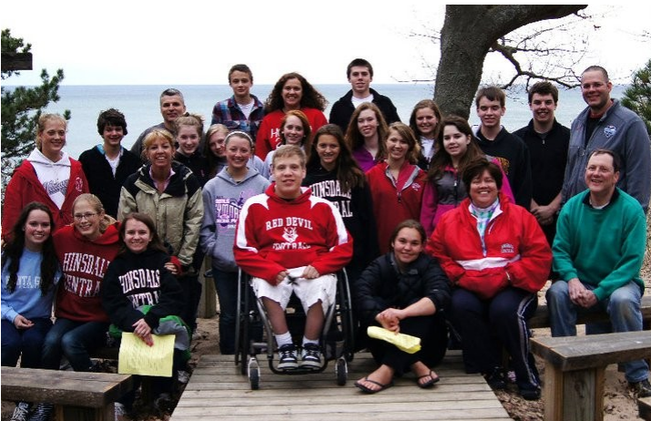
Youth Group from Clarendon Hills